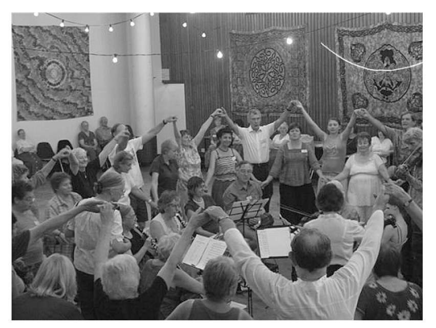
Evening Dancers Engulfing Musicians

In the afternoons we had choices to attend 2 more classes. These were a 1shot event that was taught only once. Over the week we had classes that included dances from Norway, Mallorca, Serbia, Scot- land, dances for Seniors and music classes. These were all taught by specialists who were attending the Summer school and had been asked if they would teach a special afternoon class. The music classes were attended by those who had brought their musical instruments with them. By the end of the week they were able to play a wonderful 30 minute set for us to dance to in the evening.